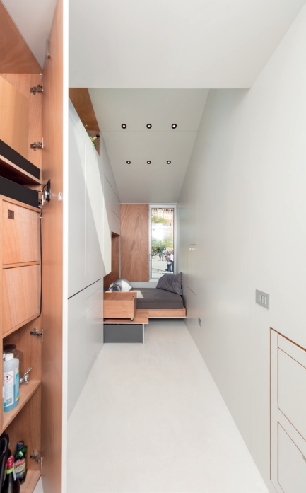
There is room for intelligent storage space around the kitchen. The folding bed also serves as seating furniture.

D-BERLIN / I-ROME. Häfele supplied clever hardware fittings for the aVOID Tiny House, a mobile 9-square-meter miniature house by 27-year-old Italian architect Leonardo Di Chiara – including the Free flap fittings and the Loox lighting system. The sophisticated equipment allows comfortable living in the smallest space. This all fits in very well with the new attitude towards life of the growing number of urban nomads who should feel comfortable in such alternative forms of living.