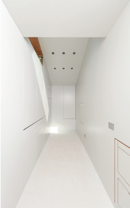
When unopened, the interior of the aVOID is a homogeneous, light grey room.