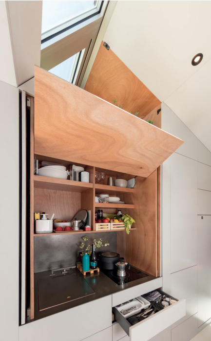
Skylights provide daylight and fresh air. Kitchen doors disappear to the side in the cabinet.

You enter the room is through two French doors on one of the narrow sides. At the opposite end, a narrow bed can be folded down from the wall. Two flat roller stools, hiding next to it in the wall, can dock onto the bed, doubling the sleeping area. The narrow bed can also serve as a sofa, offering seating for up to three people. Cooking is done in the fully functional kitchen, concealed in the functional wall in the central area of the house. The shower and toilet are located behind the wall in the entrance area.