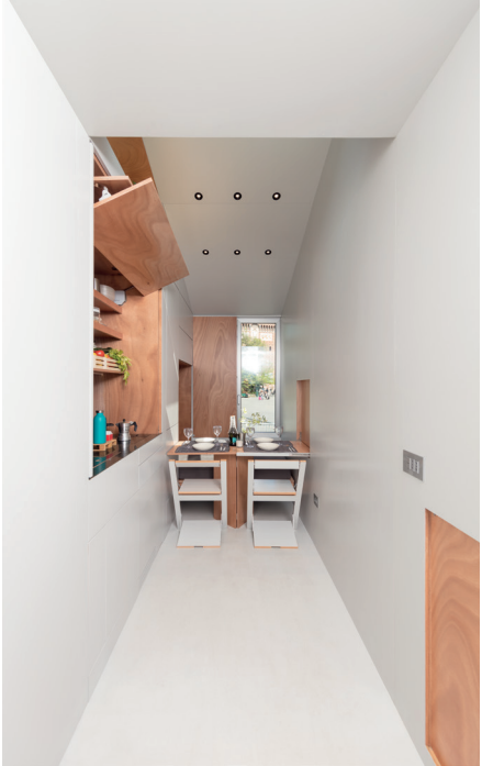
The table and chairs are foldable. The kitchen opens on the opposite side in the functional wall.